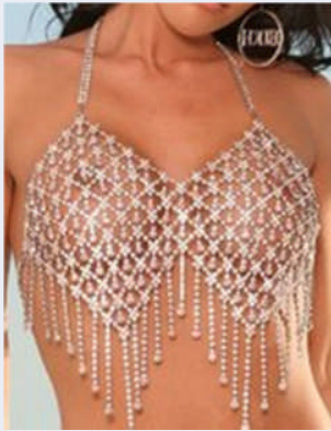
Rhinestone Top TravelBareWear Store